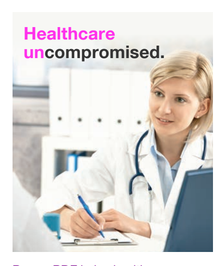
Power PDF helps healthcare organizations "go paperless" with their most essential document workflows.